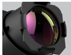
Enhanced optical design