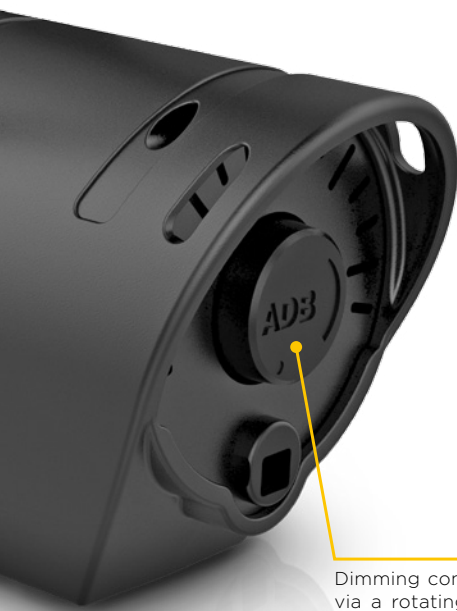
Dimming controlled via a rotating knob